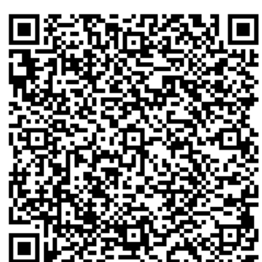
Or scan the QR code